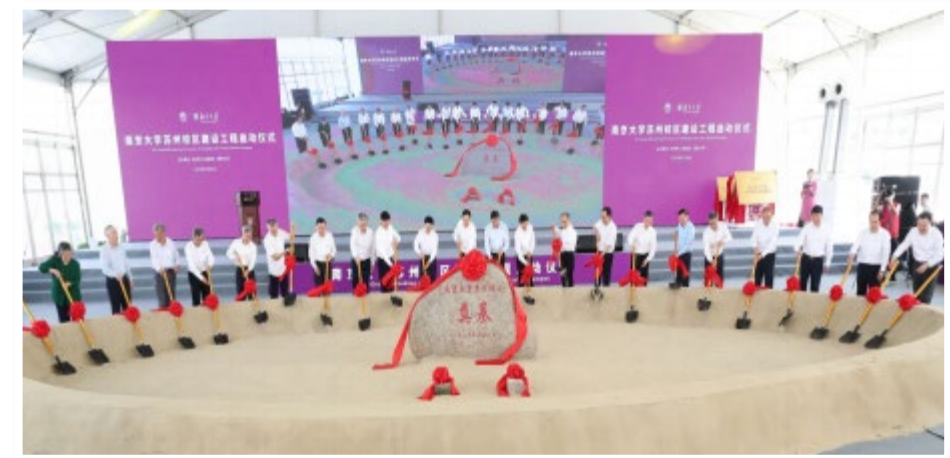
Groundbreaking ceremony of Nanjing University-Suzhou Campus